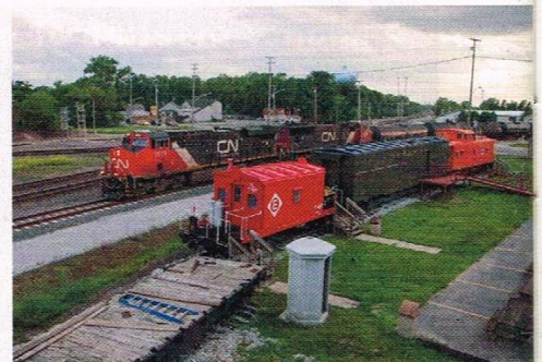
An eastbound freight bound for Kirk Yard passes the museum grounds, seen from the steps of Griffith Tower in June 2014.

FOR YOUR FAMILY: The southern portion of the Erie Lackawanna Trail crosses town, passing the junction area. The trail segment runs between Crown Point and Highland on the former EL right-of-way. Together with the northern segment to Hammond, the trail extends 15.7 miles. Trail parking is available near the diamonds.