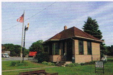
The former Grand Trunk Western depot now sits at the corner of Broad Street and Avenue A, just north of the diamonds.