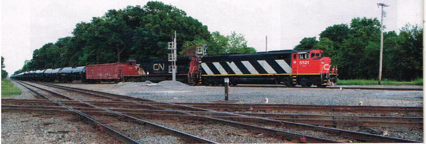
A westbound tank train moves from the former GTW to the former EJ&E to bypass Chicago congestion.

Griffith provides modern rail action in a suburban setting with plenty of history