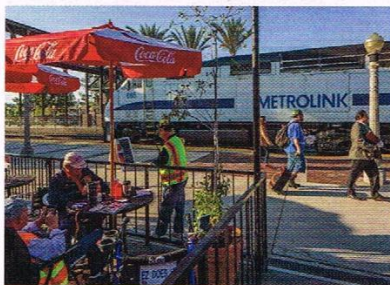
Metrolink commuter train No. 605 rolls by railfans camped out at the Fullerton station restaurant in June 2016. David Styffe