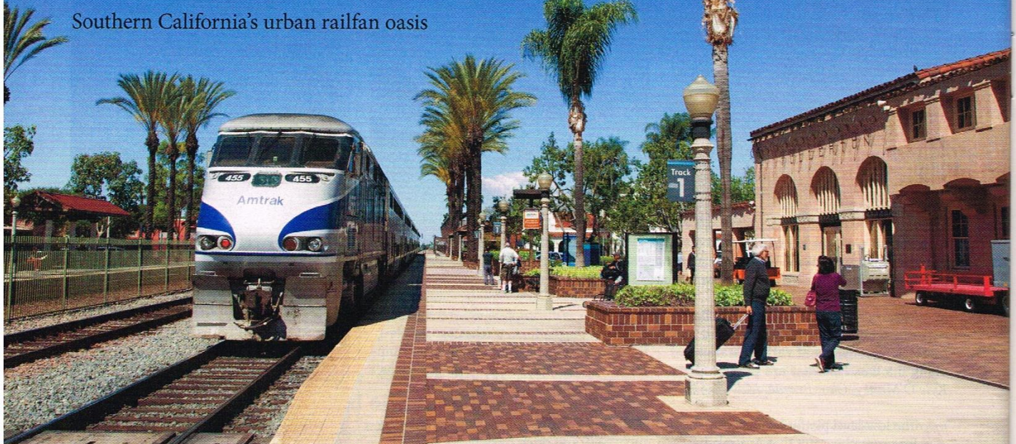
A Los Angeles-bound Amtrak Pacific Surfliner accelerates from its Fullerton station stop.

Southern California's urban railfan oasis